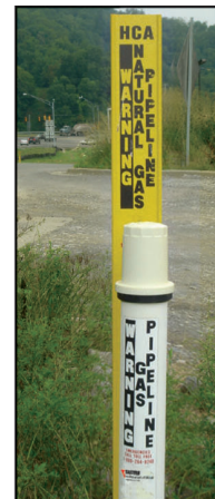
5. HCA marker and cathodic protection test station