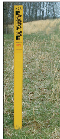
4. HCA line-of-sight marker